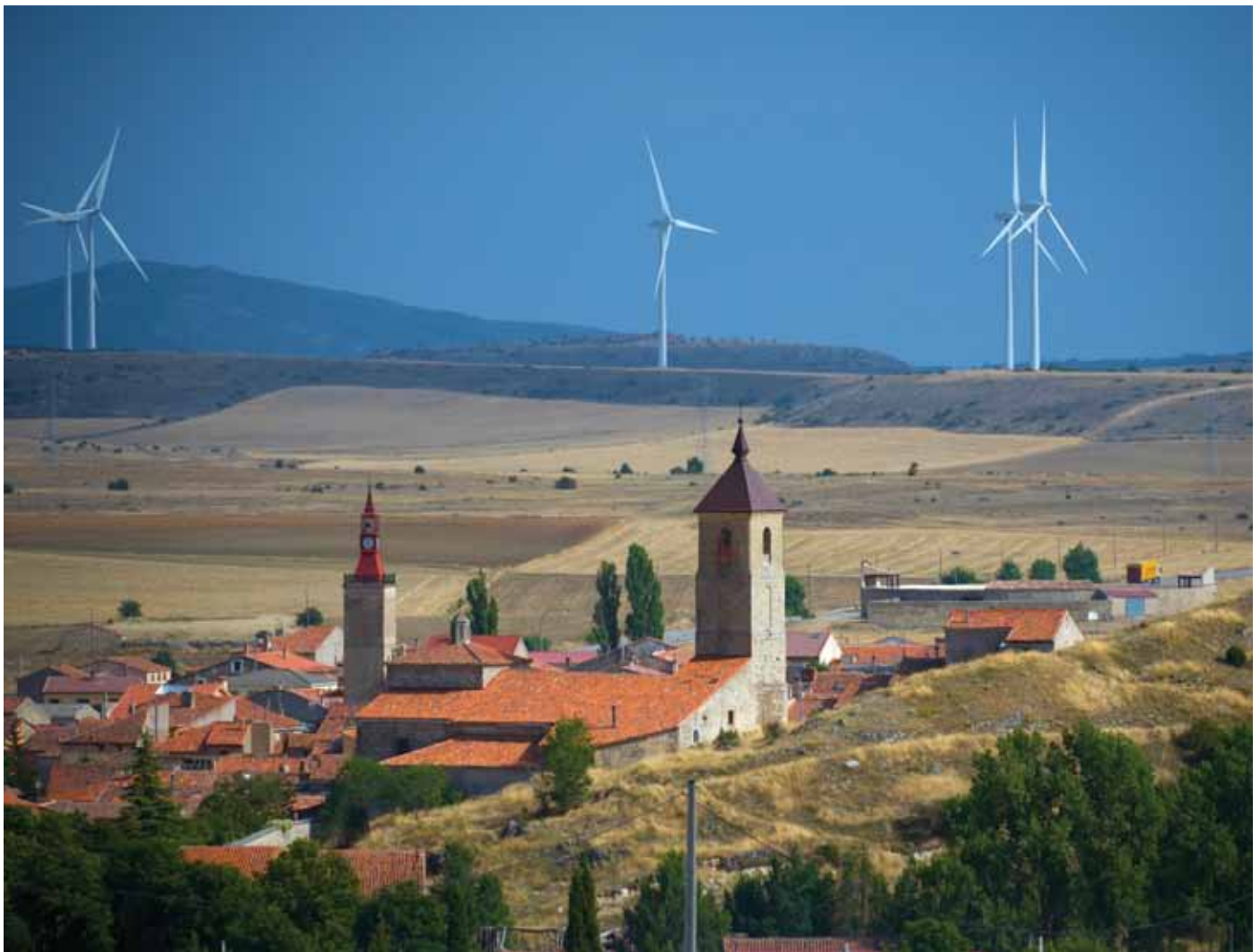
Maranchón, Guadalajara, Spain

Spain's initial success has been possible due to the existence of a strong policy regime at a time when very few similar initiatives existed. A solid industrial sector was created, and the Spanish manufacturers developed strong export capacity. However since 2010, the wind sector has almost come to a standstill and its future beyond 2012 remains unclear.