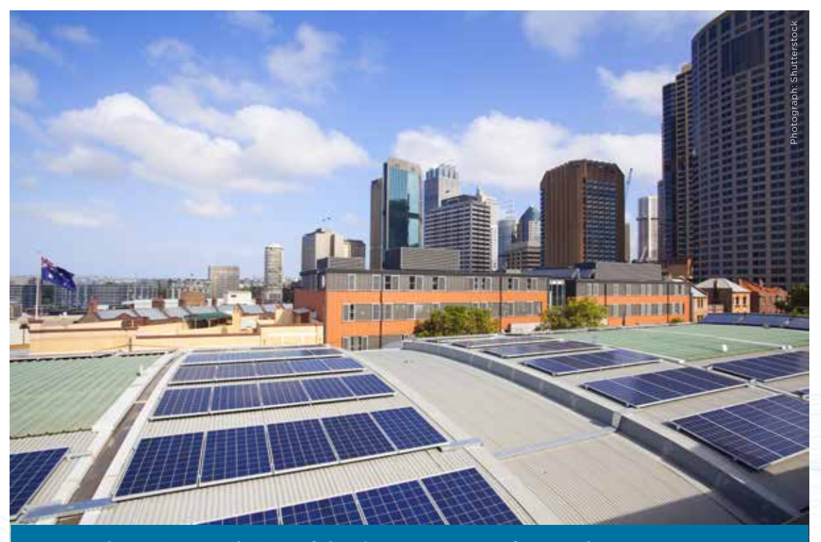
As recently as 2013, nearly 90% of the city's power came from coal

In 2013, nearly 90% of electricity consumed within city limits was generated from coal; the remaining 10% came from renewable sources. In its updated strategy, Sustainable Sydney 2030, the city plans to increase the renewable energy share to 50% by 2030 and to cover the remainder with the help of trigeneration – a technology that employs natural and recycled gas to generate electricity, heating and cooling. To reach its renewable energy goal, the City of Sydney is planning to install enough solar PV on municipality-owned properties to meet 15% of its electricity needs. It also seeks to procure additional renewable electricity through the GreenPower Scheme. As of 2018, the total installed capacity of solar PV in council sites, including office buildings, civic halls, libraries and other public spaces, had reached 800 kW and was expected to double by the end of the year (City of Sydney, 2018).