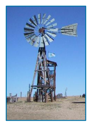
Windpump in South Dakota, USA.

At least 15 MWh (from the battery charging). The mechanical pumping doesn't count, even through the total amount of energy used could be calculated as 45 MWh (i.e. electricity used x 3).