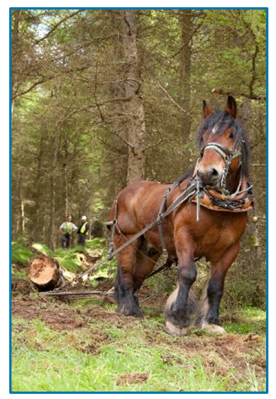
Log extraction using horses, Johnstone Forestry, UK