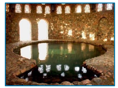
Hammam Musa (Moses' Bath), Egypt

Low-grade geothermal heat may be counted as renewable energy if it meets a need that would otherwise be met by another type of energy. In this case, it probably would not count because the demand is for a leisure activity, not heating.