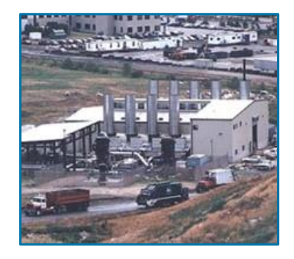
Municipal solid waste incinerator, China