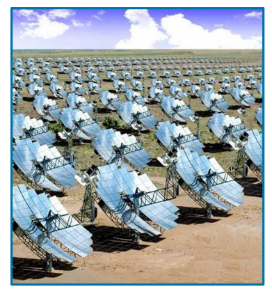
Stirling Energy System's 300 MW solar power plant in California.

What are the differences between concentrated solar PV, concentrated solar power and concentrated solar thermal energy?