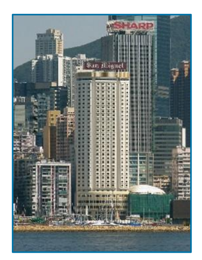
Excelsior Hotel, Hong Kong, one of several hotels using seawater air conditioning

Can this be considered as a type of renewable energy?