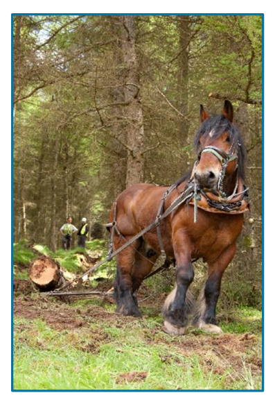
Log extraction using horses, Johnstone Forestry, UK

Considering the fuel that has been saved, is the company producing renewable energy and reducing its CO<sub>2</sub> emissions now?