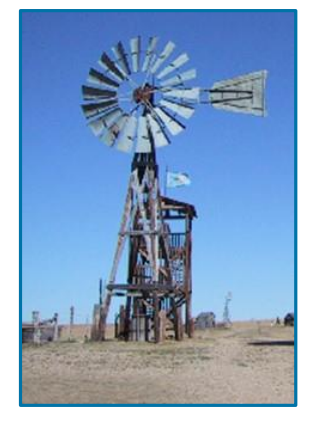
Windpump in South Dakota, USA.

What is the annual production of wind energy on the farm?