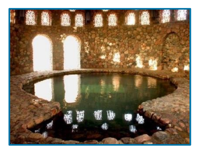
Hammam Musa (Moses' Bath), Egypt

Can the water from such springs be considered as a type of renewable energy?